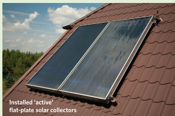
Installed ‘active’ flat-plate solar collectors