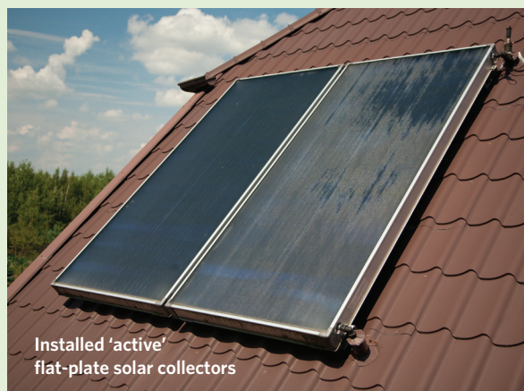
Installed ‘active’ flat-plate solar collectors