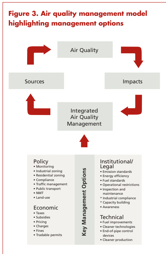
Figure 3. Air quality management model highlighting management options

World Bank Group transport sector policies, country assistance strategies, and project investments support the institution’s urban transport priorities. The World Bank Group is actively engaged in transport sector development through policy support, infrastructure development, and capacity development.